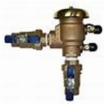
C: Sprinkler system backflow device