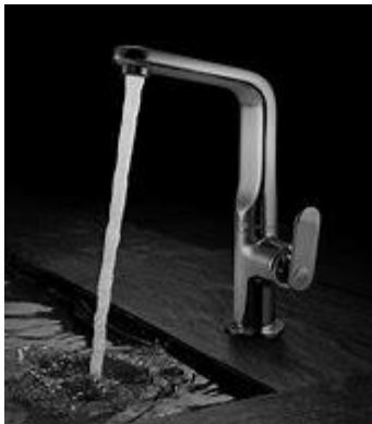
D: Air Gap