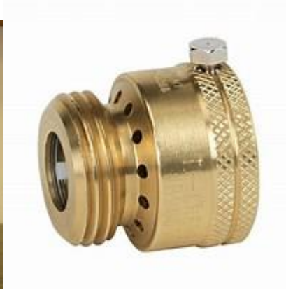
B: Hose Bib Vacuum Breaker