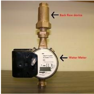
A: Water meter and backflow device

Is there a Backflow Device attached to the water meter (A)? Yes _____ No _____